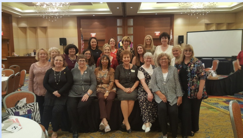
Fashion Show attendees waiting for the show to begin!